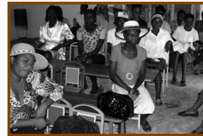
Members of the Women's Committee of Lougou, in a meeting to learn more about microcredit

One of the core elements of community development is organizing. COFHED helped to introduce the concept of organizing and its potential power for change in Lougou during its very early training events in 2003. Community members responded by forming several key groups, including the women's group in Lougou. And now, the women have taken things a step further, by applying for legal status under the name OFADEL (Women's Organization for the Development of Lougou). This influential group in Lougou has accumulated some savings while they continue to receive further training in the concept of microcredit opportunities. With a pool of 23,800 Gourdes (about $600.00 USD) from themselves and individual donors from MN, they are poised to utilize two-thirds of the money in a pilot microcredit project this winter.