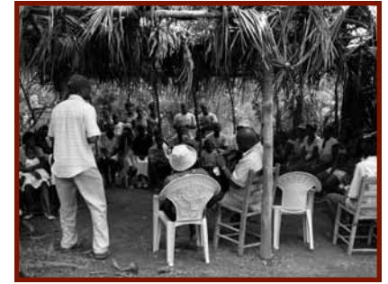
Community meeting in Nazaire

Raymond and Nazaire are twin communities located on mountain ridges not too far from Lougou. COFHED was approached by these communities to partner with them and begin the process of development that they have seen transform Lougou. In these villages, many children are not attending school, and the community lacks access to potable water. COFHED has begun engaging with these two communities together, and both villages have shown incredible enthusiasm. We will not know the community's priorities until they identify them on their own, which is an integral aspect of the sustainable and community led development process that COFHED employs. Right now we are in the "get to know" phase and training phase, but they are very anxious to start PRA training (Participatory Rural Assessment). Some young people from Lougou have offered to help us with our engagement with the Nazaire/Raymond villages, and this is very encouraging to us.