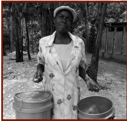
A Lougou resident, displaying her Sawyer filter unit

It was not long ago (back in March 2011) when every child and many others in Lougou received a bottle for clean water from Woodland Hills Church medical team members. But when they received their water bottles, there was no safe